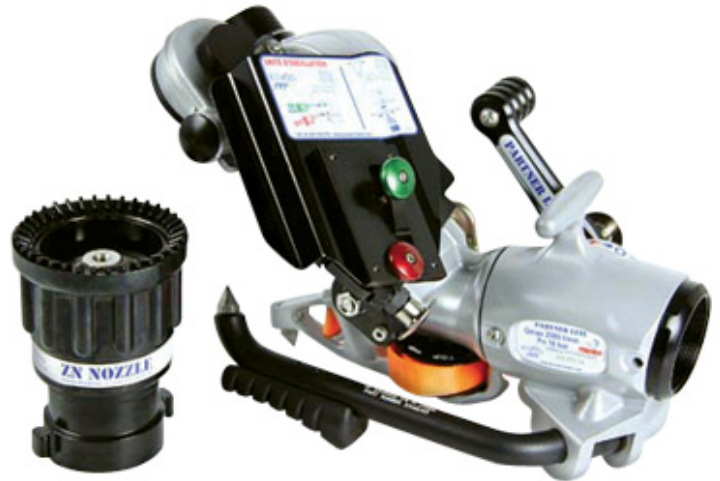
Oscillating Partner Lite