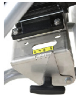
Lever to adjust the angle of inclination